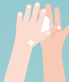
Wash hands correctly